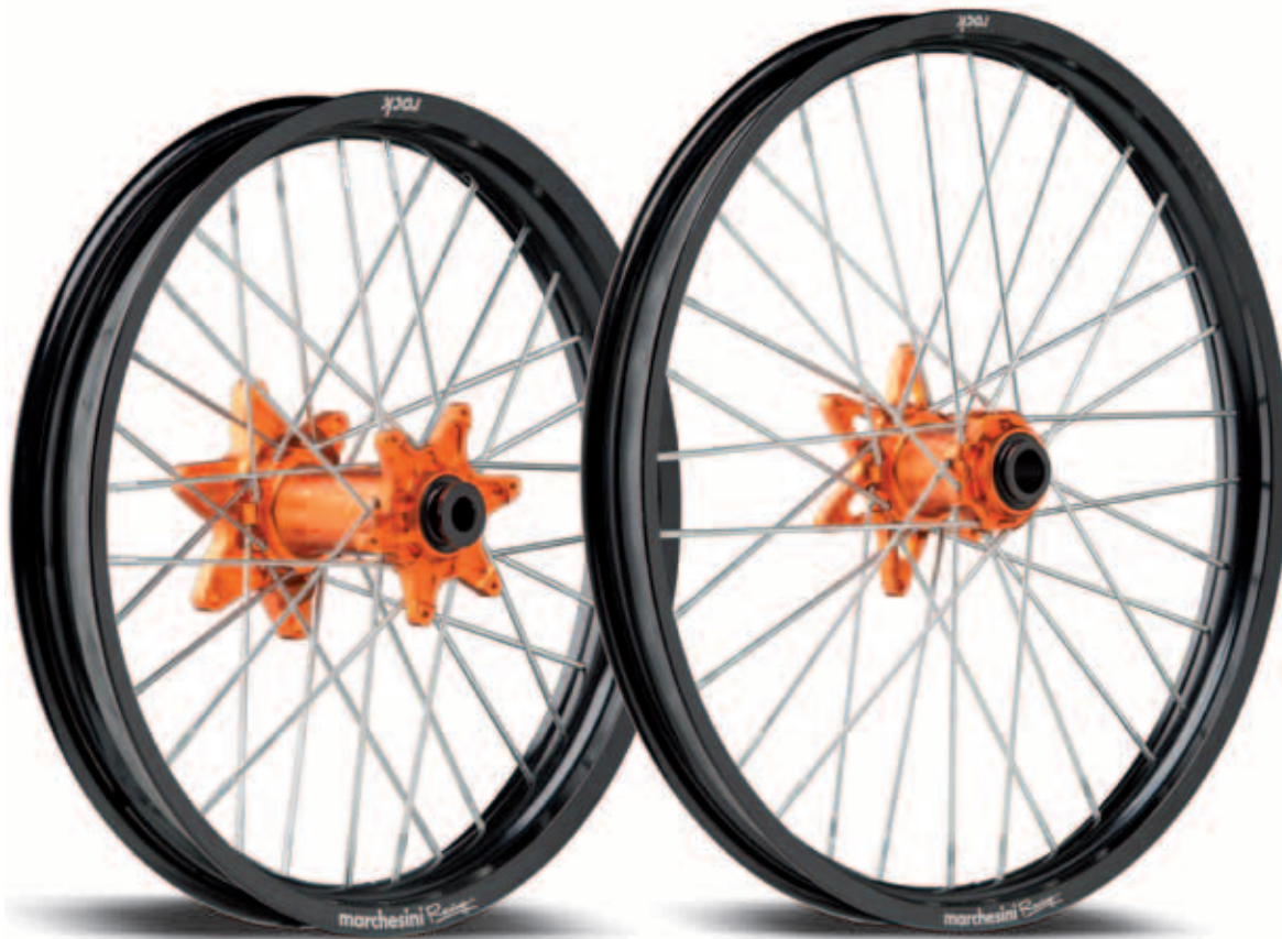
Marchesini motorbike wheels. Rock spoked wheels for cross-country motorbikes.

The Board was consistently and periodically informed on the exercise of delegated powers and on significant transactions or transactions involving potential conflict of interest.