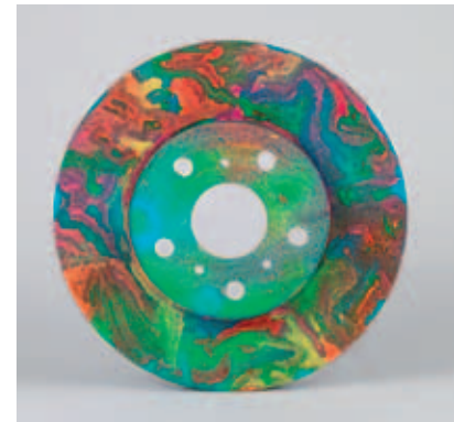
The Floating Green brake disc that won the "Art is a disc" competition.