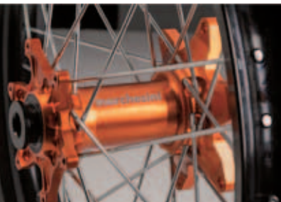
Marchesini motorbike wheels. Detail of the Rock spoked wheel for cross-country motorbikes.

To provide the necessary insights on specific issues referred for examination and approval by the Board of Directors, the Board's meetings are attended, in addition to the Secretary, by