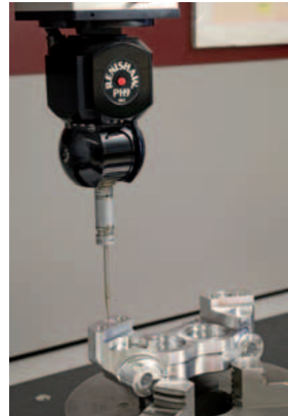
The racing plant in Curno. Checks of the first caliper workmanship phase with a three-dimensional machine.