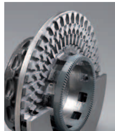
Industrial vehicles. The Star Pillar self-venting brake disc for the Iveco Starlis.

This report provides a general description of the corporate governance system adopted by the Group and information on its ownership structure, as required by current legislation. This report was filed with Borsa Italiana in the manner and within the timeframe required