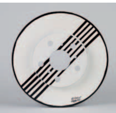
The No Limits brake disc that won the "Art is a disc" competition.