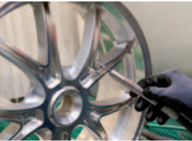
Marchesini motorbike wheels. Manual polish.

The endorsement of the Code was implemented, inter alia , by updating Brembo’s Corporate Governance Code and the Committees’ Regulations which form an integral part of the Brembo S.p.A. Corporate Governance Manual.